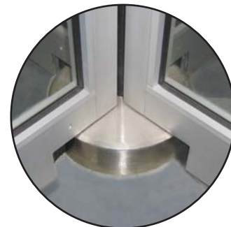
Close-Up of Collapsing Mechanism