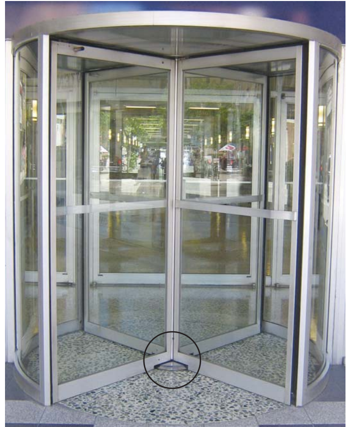
Stanley Access Technologies Series 500 Revolving Door